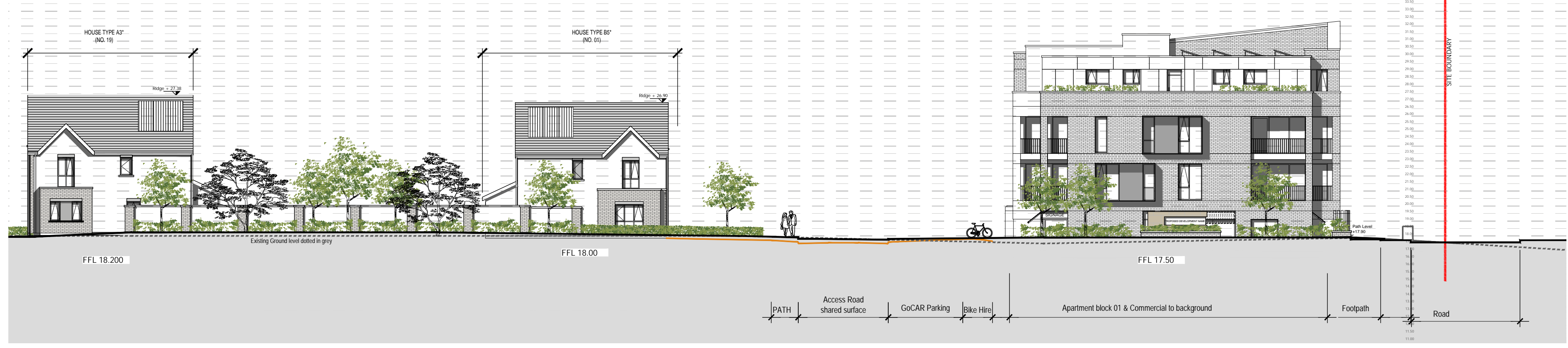
04 Site Context Elevation A-A PART 3 Scale: 1:200