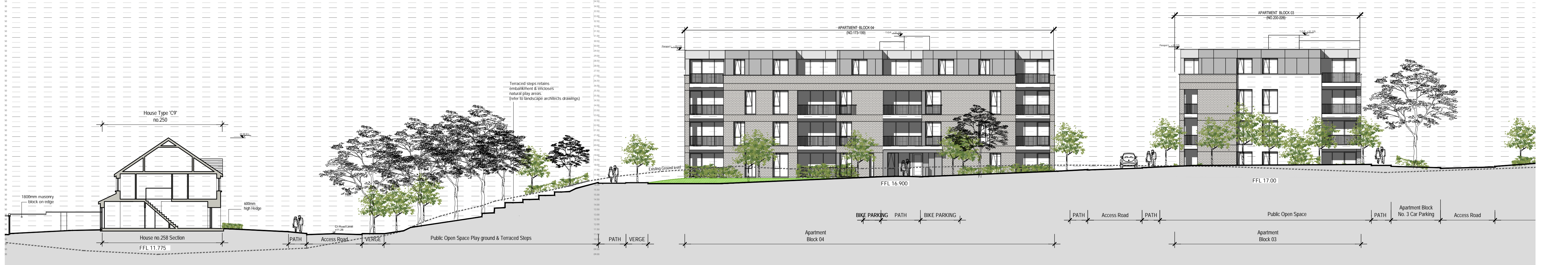
02 Site Context Elevation A-A PART 1 Scale: 1:200