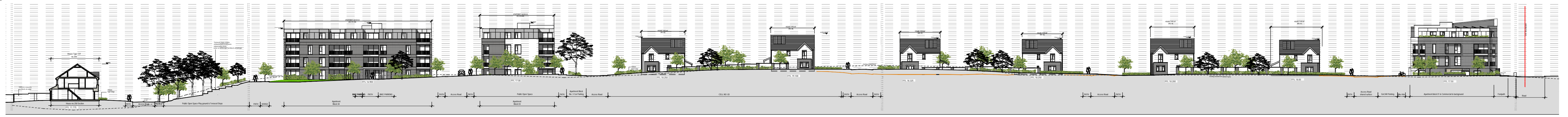
01 Site Context Elevation A-A Scale: 1:500